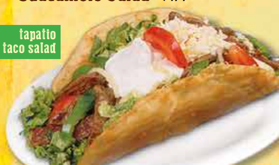
tapatio taco salad