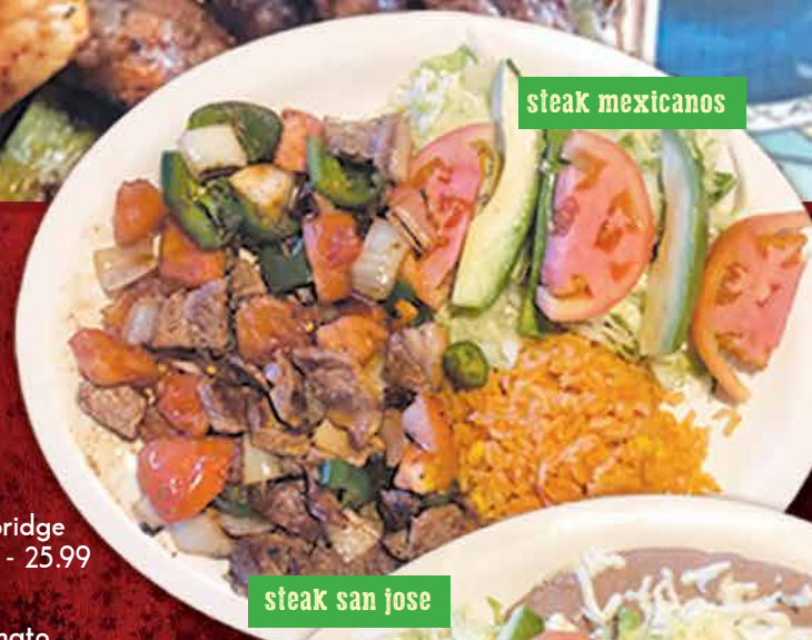
steak san jose