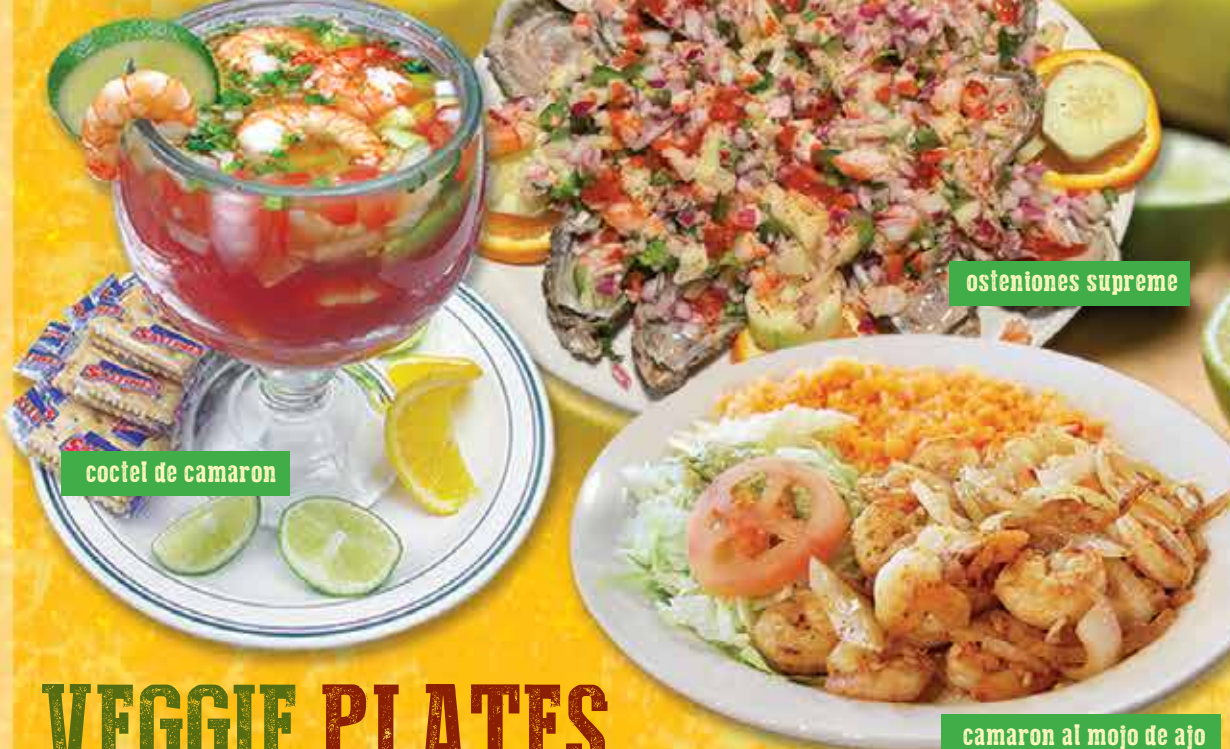
coctel de camaron

Shrimp with cucumbers and red or green sauce with juicy lemon - 40.99