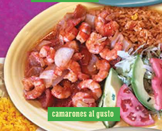
camarones al gusto